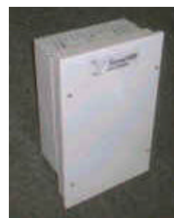
KestrelL Regulators comply with EMC requirements

Wiring for both types of regulators is simple - two wires IN from the turbine and two wires OUT to the battery.